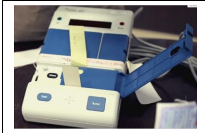
Fixing Green Paper Seal